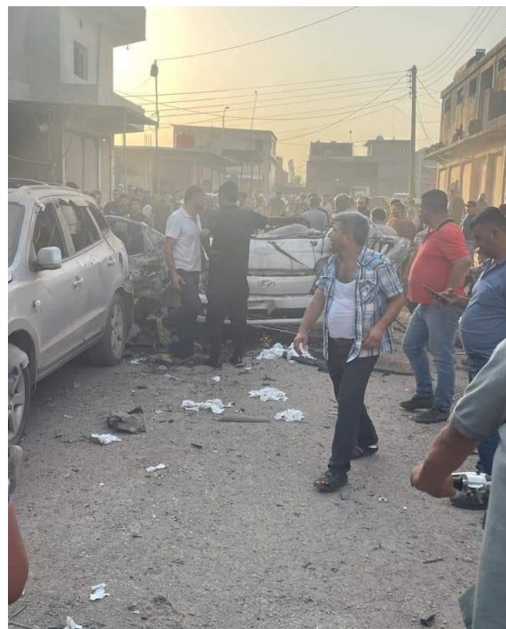
The aftermath of a Turkish drone strike in the Industrial Neighborhood of Qamishli, which killed 3 civilians and 1 SDF fighter. 2 of the civilians were children.

The rate of Turkish drone strikes has increased in the past month. In July, 11 attacks were carried out in only 11 days, killing 12 people. Recently, an attack in the city of Qamishli on August 6 killed 4 people, 3 of whom were civilians, of which 2 were children.