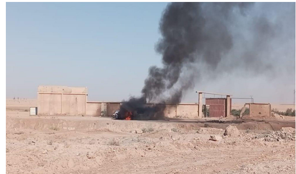
Remains of Internal Security Forces vehicle struck by Turkish drone on July 28, near Tel-Samen IDP Camp, south of Ayn Issa, in Northeast Syria.